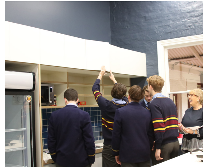
Year 12 Common Room