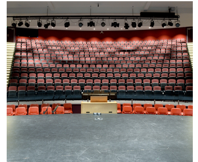
Kantor Family Music and Performing Arts Centre