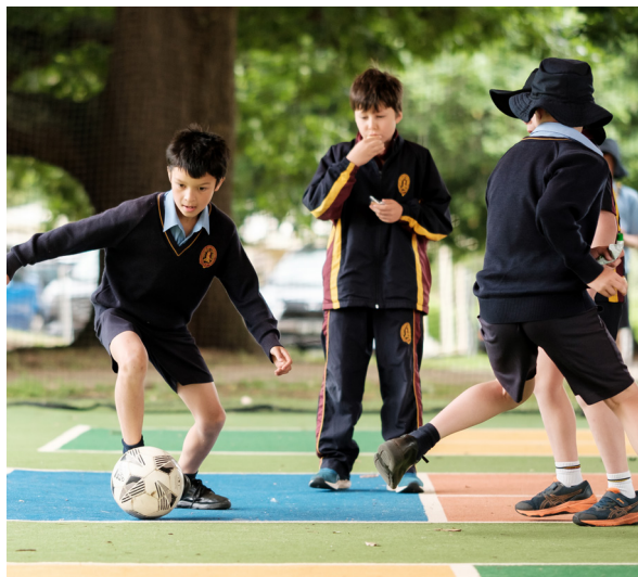
Junior School undercover area