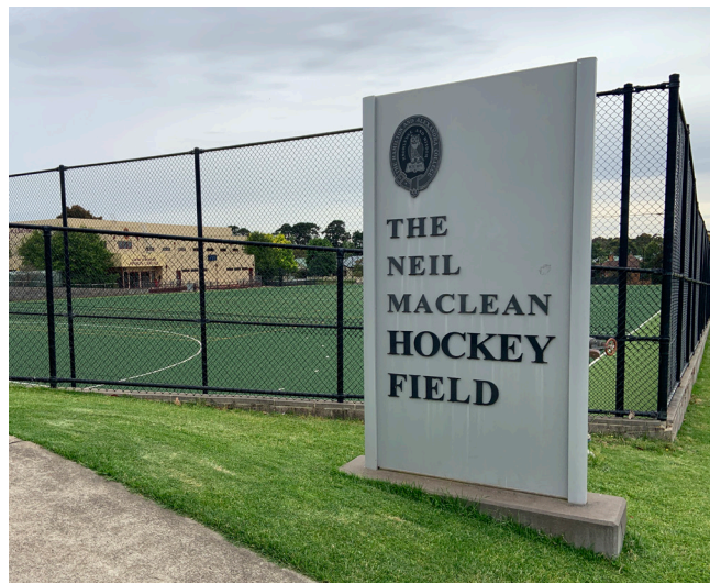
The Neil Maclean Hockey Field