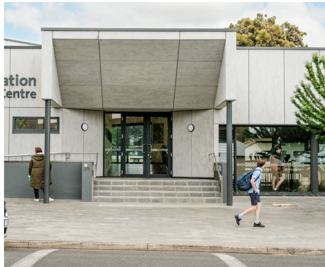
myPEC - middle years POSITIVE EDUCATION CENTRE