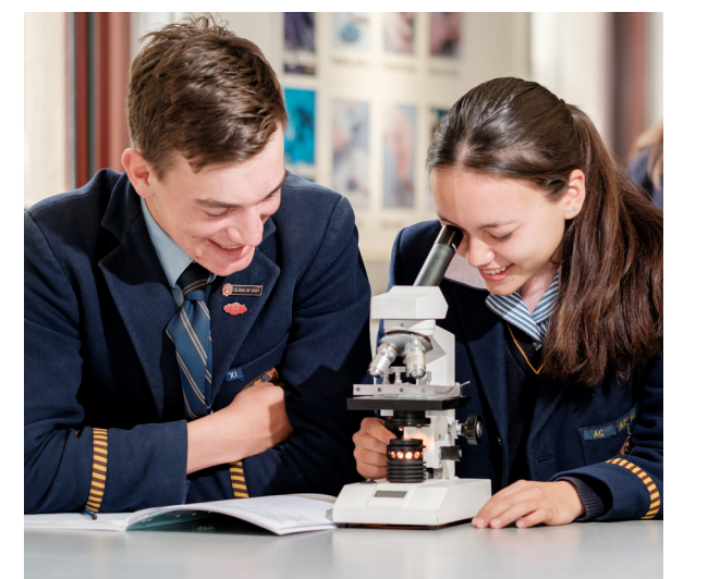
Helen Handbury Science Centre