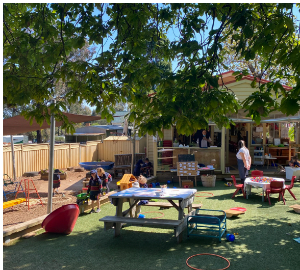
Early Learning Centre