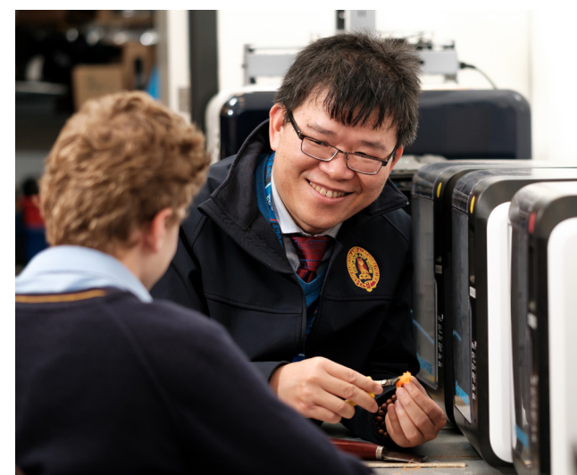
Information Technology Centre