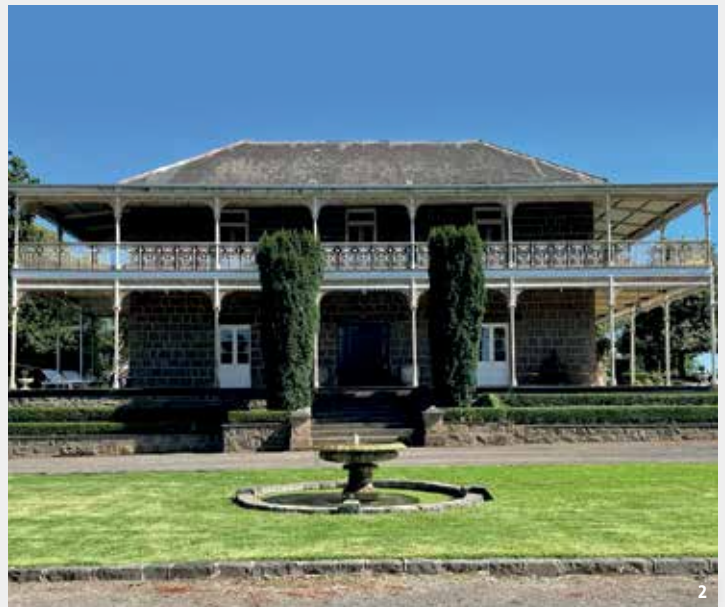
1. Ardgartan 2. Arrandoovong Homestead